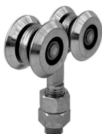
4RA - 4 ruote Portata max kg 750